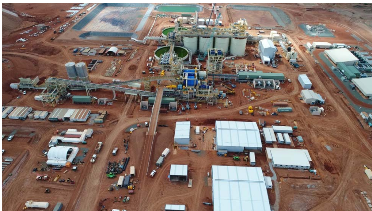
Aerial view of Process Plant

Gruyere's Final Forecast Capital Cost estimate, excluding JV support costs, remains unchanged at $621 million (100% basis), of which $284 million is attributable to Gold Road 2 .