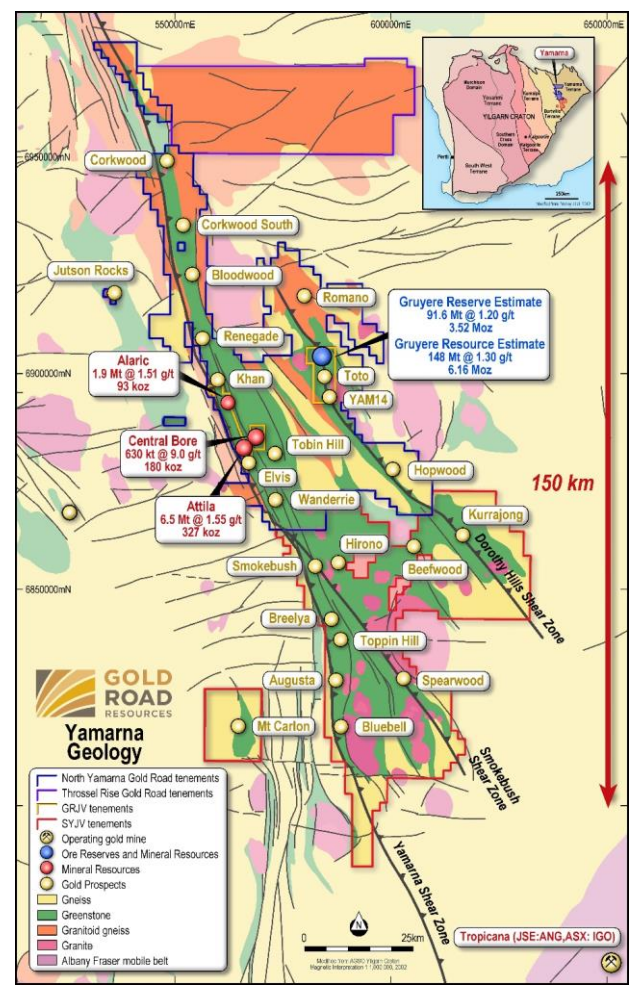
Location and Geology of the Yamarna Tenements showing Gold Road's 100% owned tenements (blue outline), Gold Road-Sumitomo South Yamarna Joint Venture tenements (red outline), and Gold Road-Gold Fields Gruyere Joint Venture tenements (yellow outline), Mineral Resources, Ore Reserves (100% basis) and main Exploration Projects

Gold Road continues to explore for similar-scale deposits on its 100%-owned North Yamarna tenements, its 50% owned Gruyere Project Joint Venture tenements (with Gold Fields Ltd) and its 50% owned South Yamarna Joint Venture tenements in conjunction with Sumitomo Metal Mining Oceania (a subsidiary of Sumitomo Metal Mining Co. Limited).