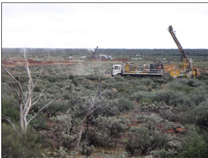
Figure 1: Photo showing all three rigs (2 RC and 1 RAB) in close proximity actively drilling at Central Bore and Justinian projects.

Gold Road plans to drill in excess of 100,000 metres throughout 2011, focussing primarily on Central Bore, Justinian, Hann and Attila as well as new gold targets. Currently all three drill rigs (one RAB and two RC) are located in close proximity at the Central Bore and Justinian projects. The monthly drill results update will be released later in June, which will include further assay results from Justinian and Central Bore.